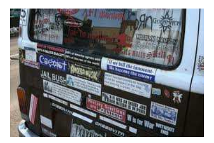
Figure 1: Research advice for a bumper sticker.

It may feel like you're going slowly, but you'll be making much more progress than if you flail around, trying different things, but not understanding what's going on.